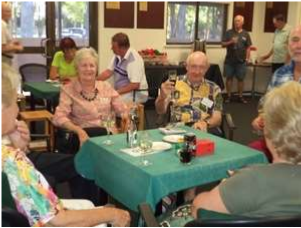
A well-earned drink afterwards