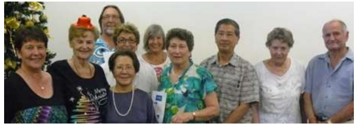
The sessional champions.