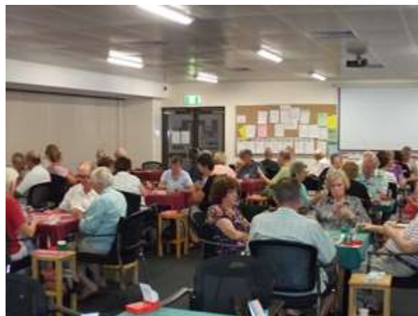
Everyone in serious thought

Mandurah Bridge Club holds an annual charity day in January each year, where the proceeds from the daily table fees are donated to a local charity. As in the previous two years, this year's donation went to Midway Community Care, which provides services for people with an intellectual disability in the Peel region. A total of 72 members played on Tuesday 21st January 2014 across 2 fields of 9 tables each and $730 was raised and donated to Midway. This is a great achievement and it is encouraging that bridge players are able to help the local community in this way. A big thank-you to all members who participated on the day.