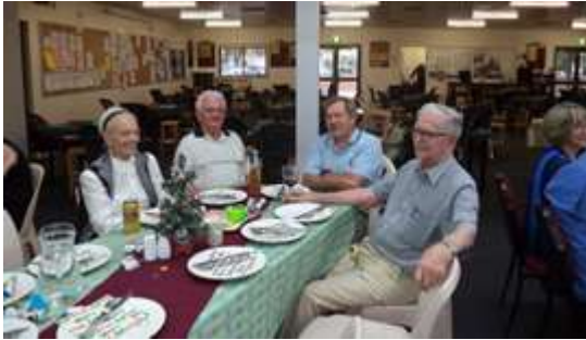
Jackpot Competition Winners December 2015