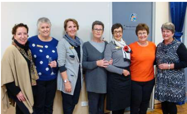
The fabulous Zonta ladies who provided, yet again, for the 13 th year for Zonta Charity the most fabulous array of day long and lunch fare.