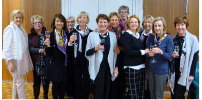
The gang was all there from South Perth Bridge Club!