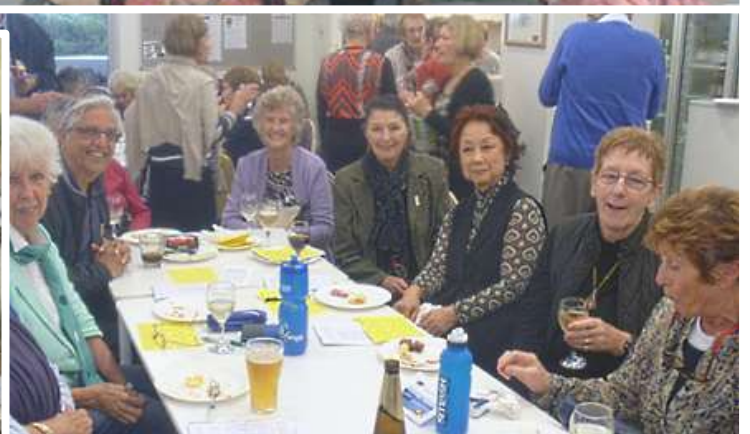
All smiles from South Perth Bridge Club