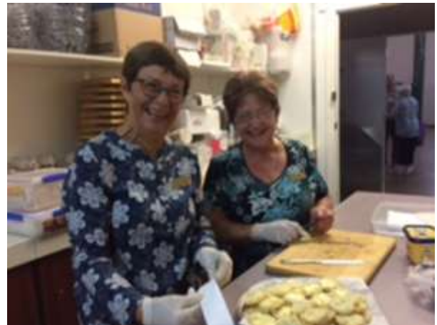
Having fun in the kitchen