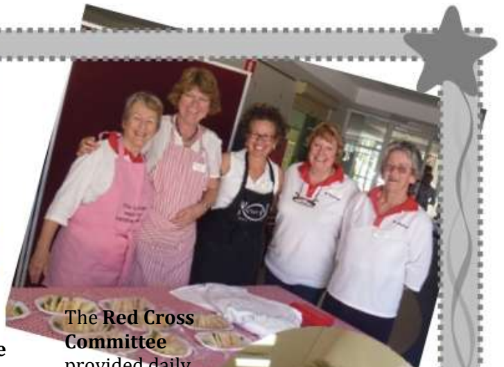
The Red Cross Committee provided daily lunches