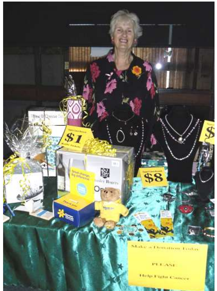
I registered as a fundraiser for Cancer Research a few months ago so was well prepared for my stall at the Capel Country Club Markets on Sunday, 12th October. I had two raffles running and a stall of goodies for sale. The weather was fine but with a cold wind so there were fewer people up and