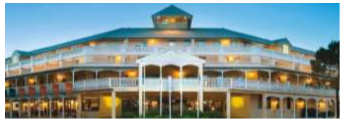
The Rydges Esplanade Hotel, Fremantle