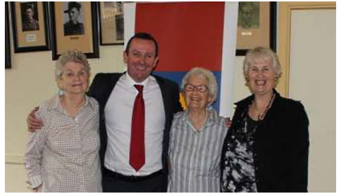
Morning Tea with the Hon. Mark McGowan at the Seniors Forum in Capel.

Now that my son has teenage children, he can now appreciate our role as his parents. Believe me; what goes around definitely comes around. Whenever my son complains of any hiccups with his children and their behaviour, Mother can always recall his youthful antics and of course, share them with her grandies. Back to reality and living in a different century, we all need to keep a good sense of humour. We need to laugh more. It's Nature's way of relieving stress and keeping us healthier. Don't sweat the small things. Love, Laugh and Be Happy. It's the only way to go.