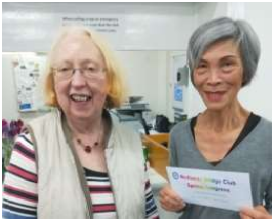
4th Laurel Lander and Se-Moi Loh Plate