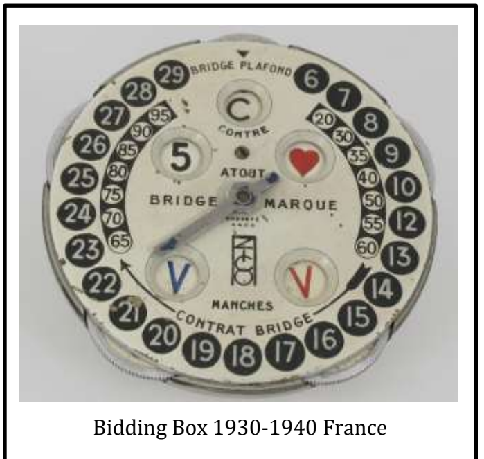
Bidding Box 1930-1940 France