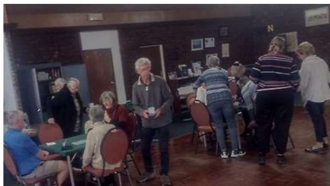
Players attempting to find their new partners