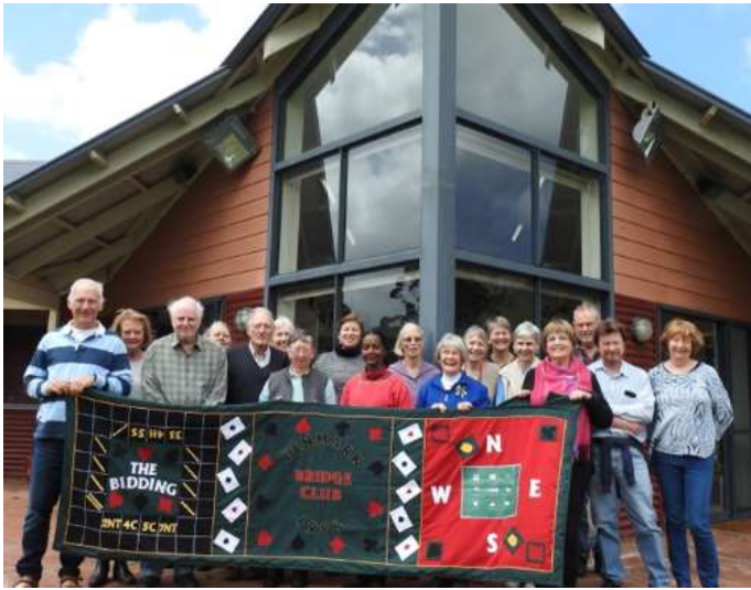
Denmark Bridge Club members outside their new premises at the Denmark Recreation Centre Complex.

So, the decision was taken to book the Shire of Denmark's Recreation Centre, which allowed more tables and a comfortable environment.