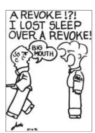
Jude Goodwin Cartoons, from the book "Go Ahead, Laugh", published by Master Point Press