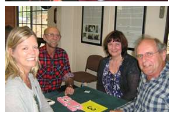
The Birthday lunch was delicious, the bridge was good, the raffles magnificent and everybody had a fun day.