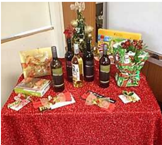
Table laden with raffle prizes