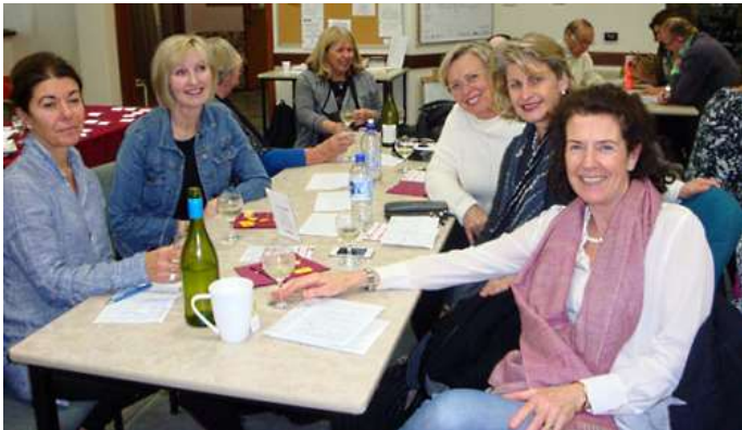
Relaxing after a great day!

Our 3 day Congress begins Sept 18th, Do join us for a fabulous weekend of bridge. See flyer in this issue.