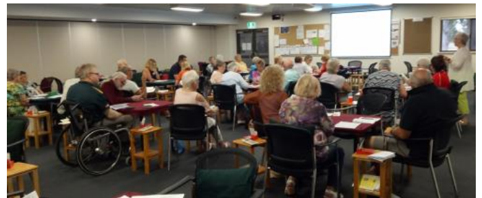
Very attentive students, carefully listening