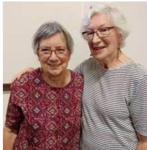
Club Championship winners

Presentation of our trophies then took place –