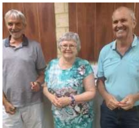
Winners E/W were: