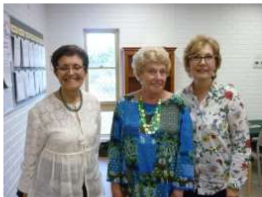
Best UBC under 300 Masterpoints