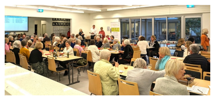
Super Saturday – Post Bridge Fun and Games in the Social Area.

<u>Super Saturday</u>: A good turnout including a supervised section. Happy bridge; red points; a thought-provoking bidding quiz (yes, sometimes Pass is your best option); food; bingo; prizes and course the Matilda's nail-biting, perfectly timed shootout; all combined for a very enjoyable day. Don't miss the next Super Saturday in November.