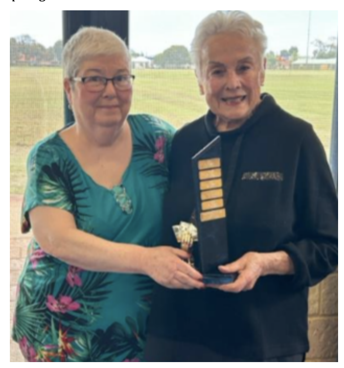
Spring Pairs - Red Point Event